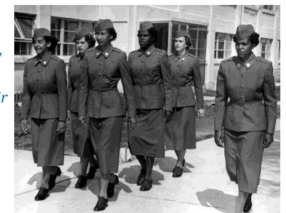
The Women's Army Corps (WAC) demonstrating their skill in drilling, WAC Center, Ft. McClellan, AL, June 1955.