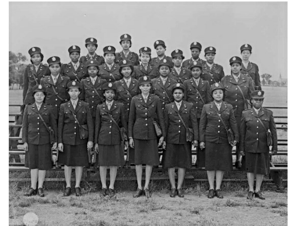
The arrival of the first African-American nurses in England, European Theater of Operations, 1944